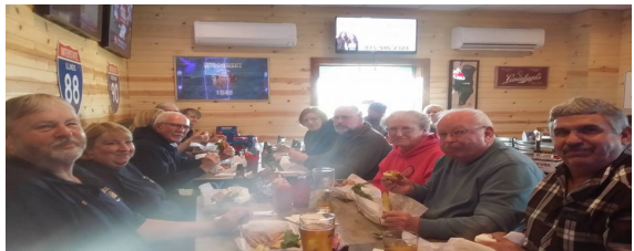
Sponsor Dinner at the Boulevard, Sterling.